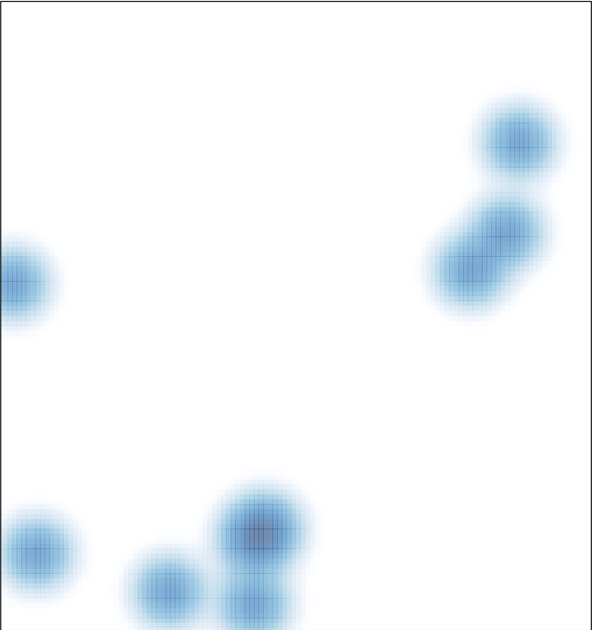
# features = 11 , max = 1